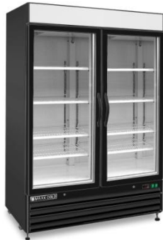
MXM2-48RB (Color: Black)