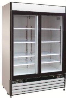
MXM2-48RS (Door: Sliding) IMAGE SHOWN MXM2-48RSB (Color: Black Door: Sliding)

Glass Door merchandisers are designed for durability and visual appeal in promoting your product. Glass door merchandisers are energy efficient and effective at keeping product at exactly the right temperature. This keeps food fresher for longer. The simple-to-use but precise digital controls allows for accuracy in temperature and flexible use of the unit.